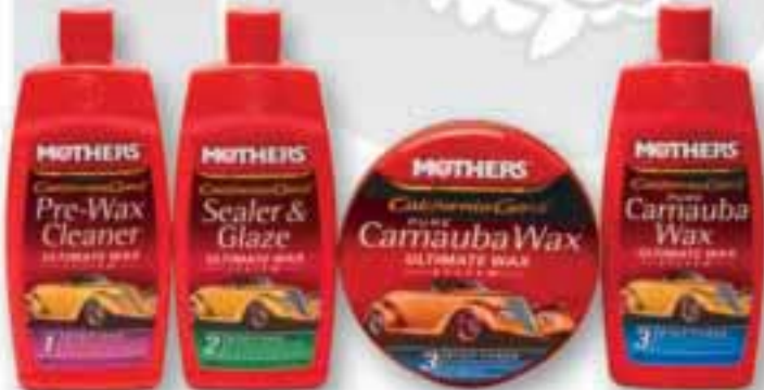
California Gold® Ultimate Wax System®