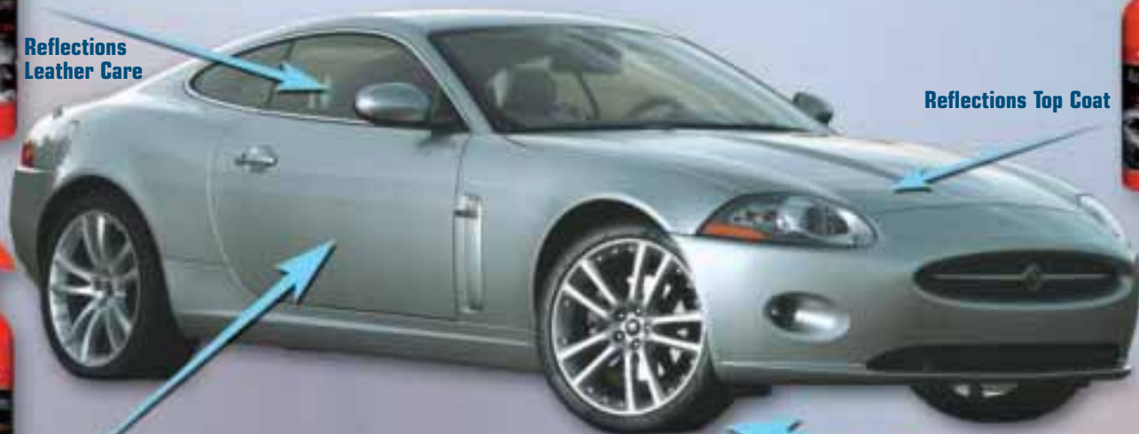
Reflections Top Coat