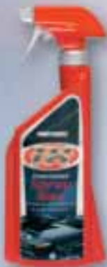
FX® Spray Wax