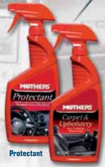
Protectant Carpet & Upholstery