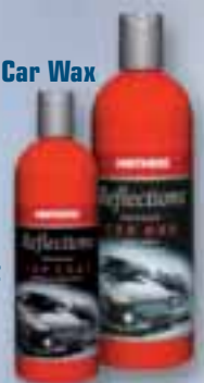
Reflections Car Wax