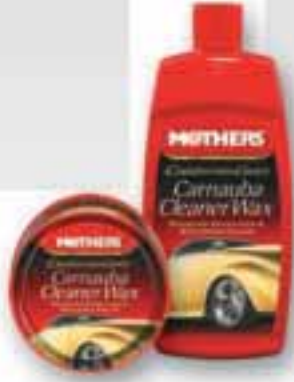
California Gold® Carnauba Cleaner Wax