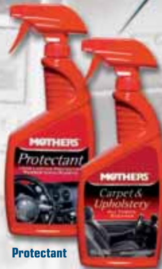
Protectant Carpet & Upholstery