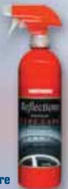
Reflections Tire Care

See individual product labels for specific application information.