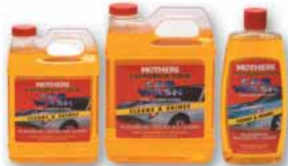
California Gold® Car Wash