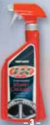
FX® Wheel Cleaner

See individual product labels for specific application information.