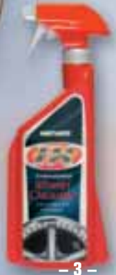
FX® Wheel Cleaner

See individual product labels for specific application information.