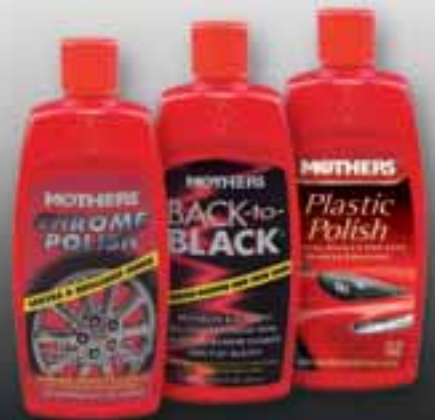
Additional Mothers® Products

See individual product labels for specific application information.