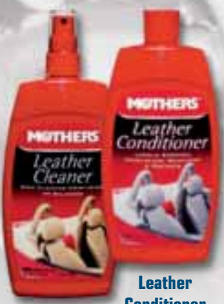
Leather Cleaner Leather Conditioner