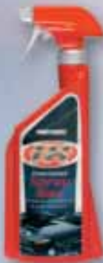
FX® Spray Wax