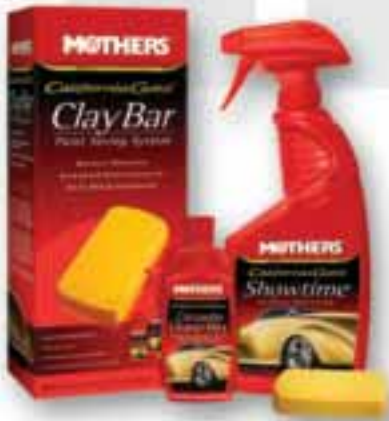
California Gold® Clay Bar System