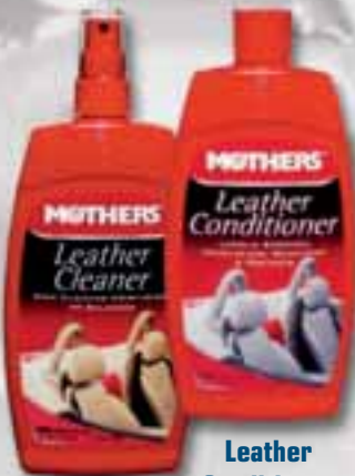
Leather Cleaner Leather Conditioner