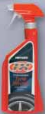
FX® Tire Shine